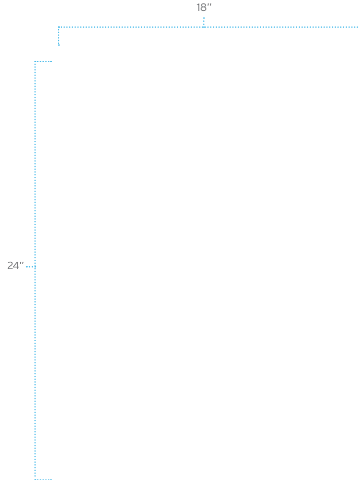
24 x 18 Lawn Sign

Length x Width 24'' \times 18'' = 432'' 25\% \text{ of } 432'' = 108''